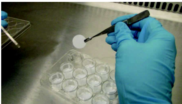
Figure 1. Alvetex® discs can easily be removed from the 12-well plate using flat ended forceps (Fisher Scientific, MNK-155-M).

In the 12-well plate format, the alvetex® is held in place by a polystyrene clip that can easily be removed to release the disc for analysis of the cultured cells (Figure 1.)